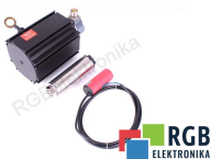
SACC-VB-4CON-M16/A PHOENIX CONTACT

New PHOENIX CONTACT SACC-VB-4CON-M16/A Tested and cleaned. 12 months guarantee Dedicated courier Delivery across Europe even in 15855